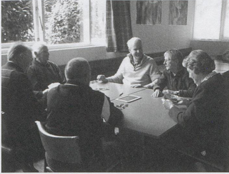
A game full of surprises!

ing with six players and two sets of cards. The two teams of three excellent players each quickly adapted to the new form, and we had a great afternoon. Two players had to leave early, around 4pm, and the remaining four players then had a more traditional game, which was fun, too.