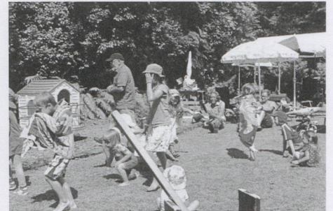
The rush to the treasure hunt

preciated distribution of ice-creams. Some quick adults were able to snatch some too.