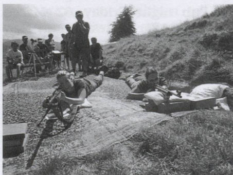
In the footsteps of William Tell?

Our shooting event went very well again this year with 20 par-