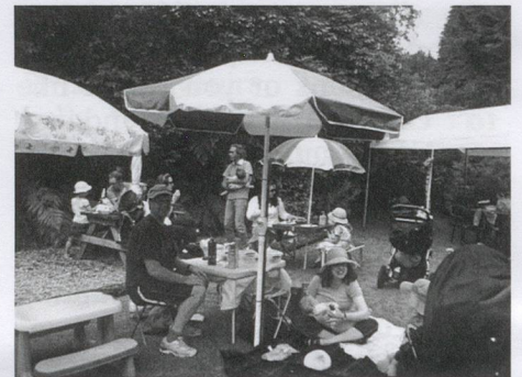
A lovely way to spend a Sunday afternoon

We had the visit of a neighbour's little dog, who seemed very excited by such a friendly crowd!