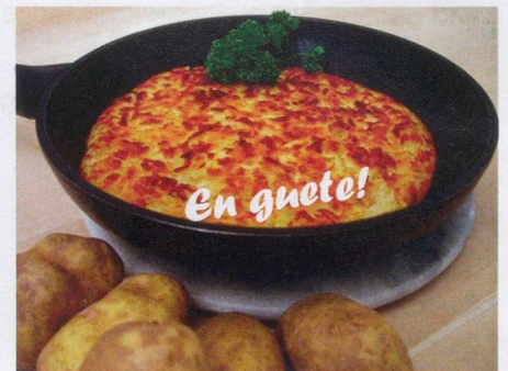
What is your favourite New Zealand potato for a great Rösti?