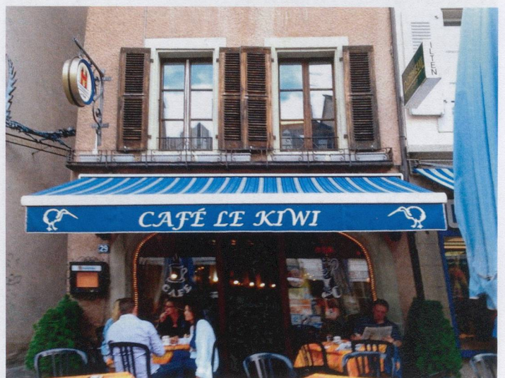
„Café Le Kiwi“ in Morges