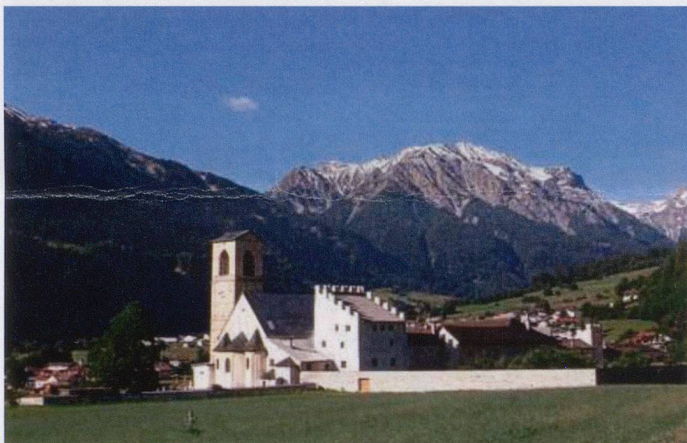
The village of Müstair, with the Convent of St John in the foreground

Val Müstair is a valley at the very eastern-most corner of Switzerland and also the home to the Convent of St John's of Müstair, a UNESCO World Heritage Site (refer to page 24). Although the valley is part of the Swiss Engadin region, it is geographically separated from it by the Ofen Pass ( Pass dal Fuorn in Romansh), facing south towards the Süd Tirol and Vinschgau regions in Italy.