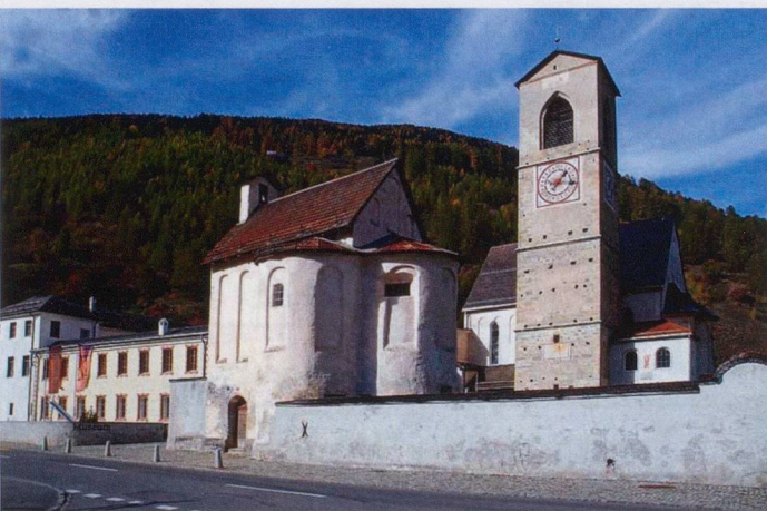
Benedictine Convent of St John at Müstair

The figurative paintings include scenes from the Old and New Testaments and are of a fine aesthetic quality. Painted in a limited range of ochres, reds and browns, they postdate the frescoes of Castelseprio and San Salvatore in Brescia. They are particularly important to understanding the evolution of Christian iconographic themes, such as the Last Judgement. The panels are framed with painted strips of garlands and ribbons, and culminate at the top into a large cornice.