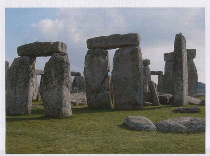
Stonehenge in England

Stonehenge is a prehistoric monument located in England, about 13 km north of Salisbury. One of the most famous sites in the world, Stonehenge is composed of a circular setting of large standing stones set within earthworks. It is at the centre of the most dense complex of Neolithic and Bronze Age monuments in England, including several hundred burial mounds.