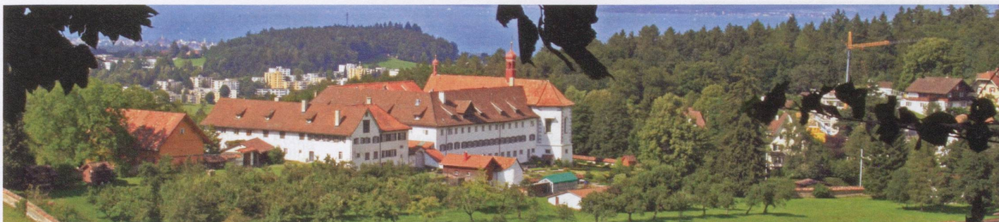
The Convent of Notkersegg, overlooking St. Gallen and Lake Constance in the North, forms part of a picturesque walking trail by St. Gallen