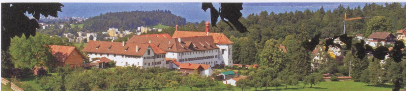
The Convent of Notkersegg, overlooking St. Gallen and Lake Constance in the North, forms part of a picturesque walking trail by St. Gallen