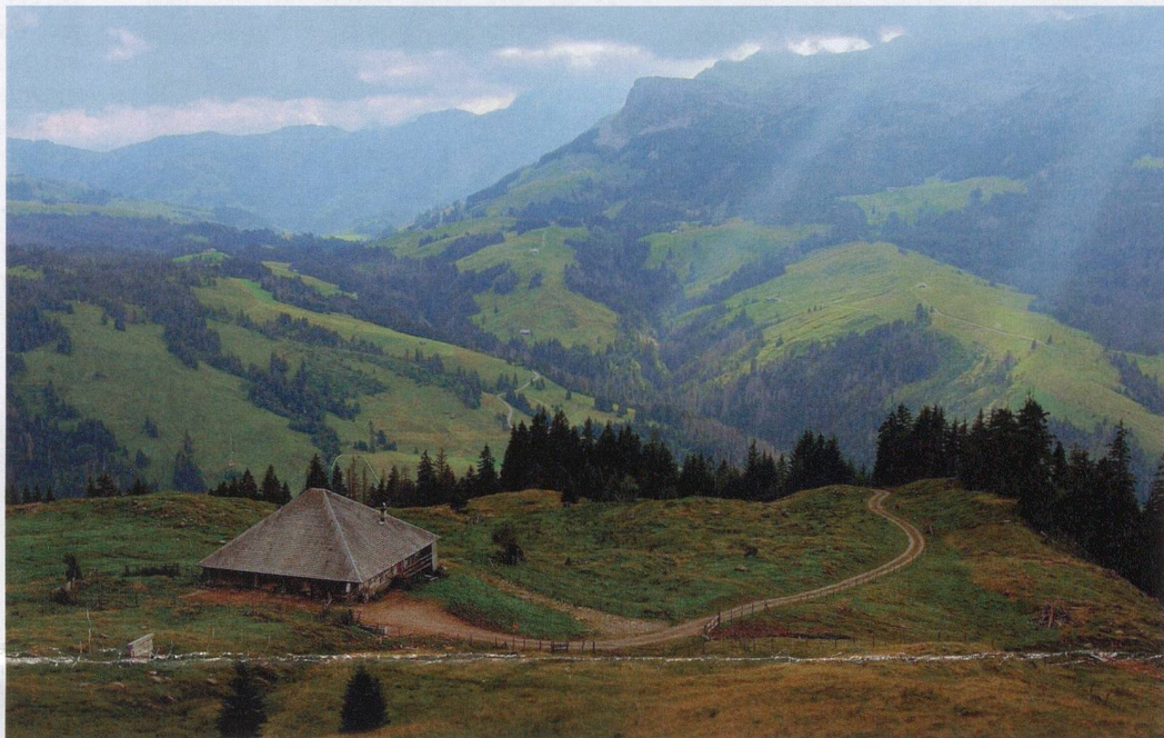
View from the Mittlist Gfäll Alp to Schrattenflue and Chemmeribodenflue in the Entlebuch region