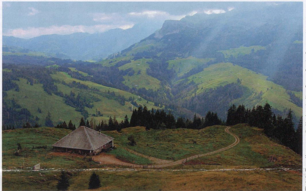
View from the Mittlist Gfäll Alp to Schrattenflue and Chemmeribodenflue in the Entlebuch region