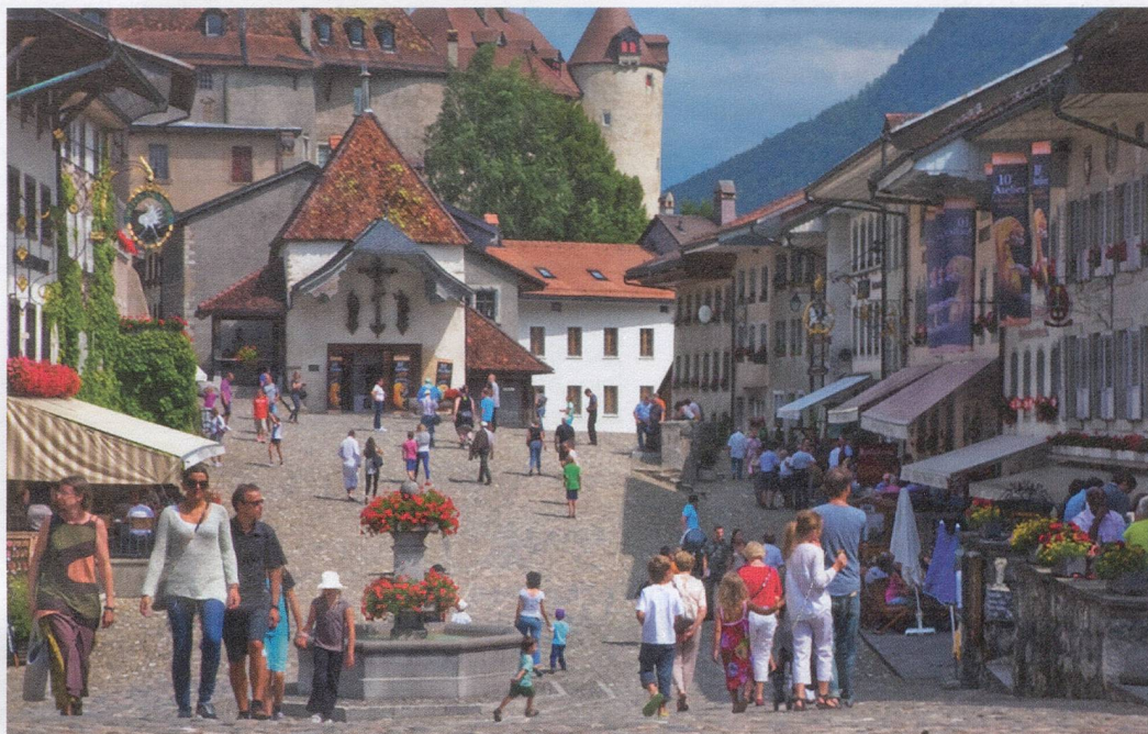
Old town of Gruyères facing towards Gruyères castle

Fancy some cheese, chocolate and culture? Then the district of La Gruyère is the place to go, being at once the home of Gruyère cheese, Cailler chocolate and some famous cultural experiences.