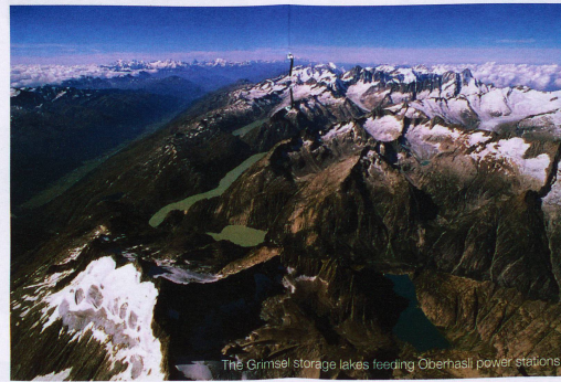
The Grimsel storage lakes feeding Oberhasli power stations

The uninitiated would certainly become hopelessly lost within this alpine labyrinth, with many parts only accessible on