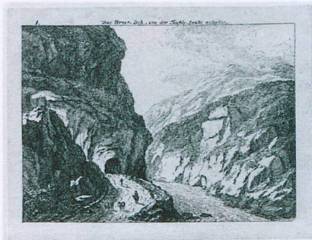
The Schoellenenschlucht (gorge) and Urnerloch, Switzerland's first alpine tunnel, drawn by Salomon Gessner, 1781

became a much safer and easier way to reach destinations crossing alpine terrain. For many years tunnel building was achieved using only explosives and physical labour to cut through the rock and earth, but in more recent decades, tunnel boring machines have taken over, chewing their way ever faster through a multitude of hills and mountains. If averaged out, over the past 300 years, Switzerland has built around 11 meters of tunnel per day - although most of this has taken place only over the past century or so. To date, a total of about 814 km of road tunnels, and 424 km of rail tunnels have been constructed.