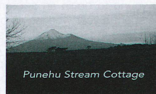
Punehu Stream Cottage

PH: 027 339 4774 ursula@glassengraving.co.nz www.glassengraving.co.nz