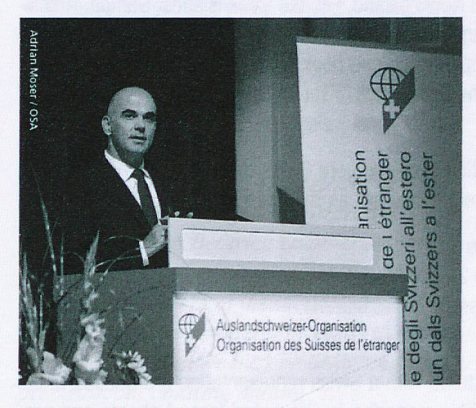
Federal Councillor Alain Berset giving Opening address

About 116 delegates from all over the world assembled in the historic town hall on Friday 18th August for the constituent meeting of the new Council of the Swiss Abroad (CSA) for the term 2017-2021.