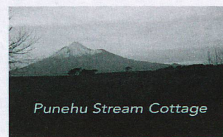
Punehu Stream Cottage

Situated on the Surf Highway 45 just 6km south of Opunake.