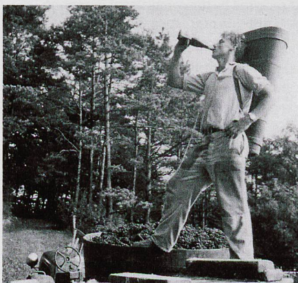
Sampling during grape harvest

Schloss Sonnenberg in Stettfurt, TG became my next place of employment. The castle and farm then belonged to the Monastery of Einsiedeln which is now owned by an Austrian millionaire and has been under renovation for at least the last 15 years. The farm consisted of around 160 acres of which 100 were forest. I was in charge of two Oldenburger horses, Frida and Bella whose job it was to drag the logs out of the forest to the road. We were also busy cutting and carting firewood to the local bakery. One dark and foggy morning, there was a scary incident while carting the milk to the collection point. Frida missed her footing and slipped off the track. I managed to undo all the straps from buggy before she went further down the bank. Back on the track, she was re-hitched to the buggy and we carried on. While working there, I met Hans Rust who was the tractor driver, and I mentioned that I had thoughts of