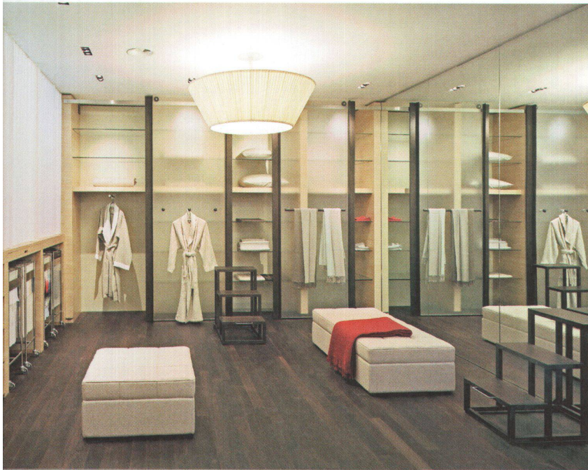
^Wall panels, shop floor and shelves made of simple Japanese Sen ash.

>Interior fit out procedure: Pre-qualification