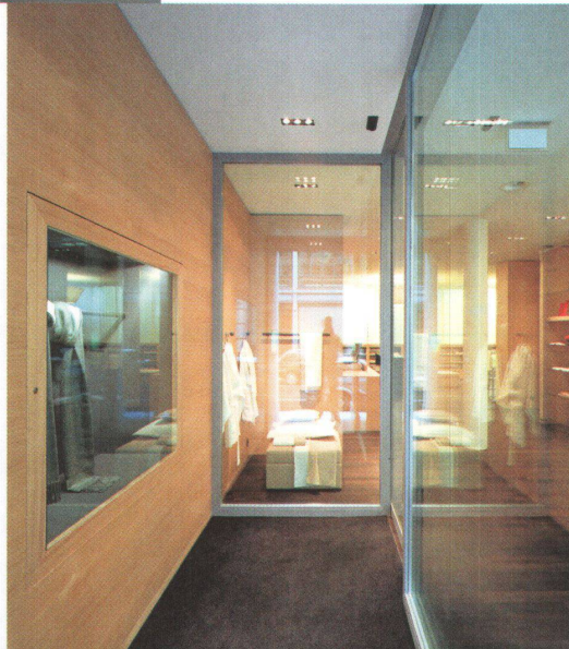
<The entrance as display window.