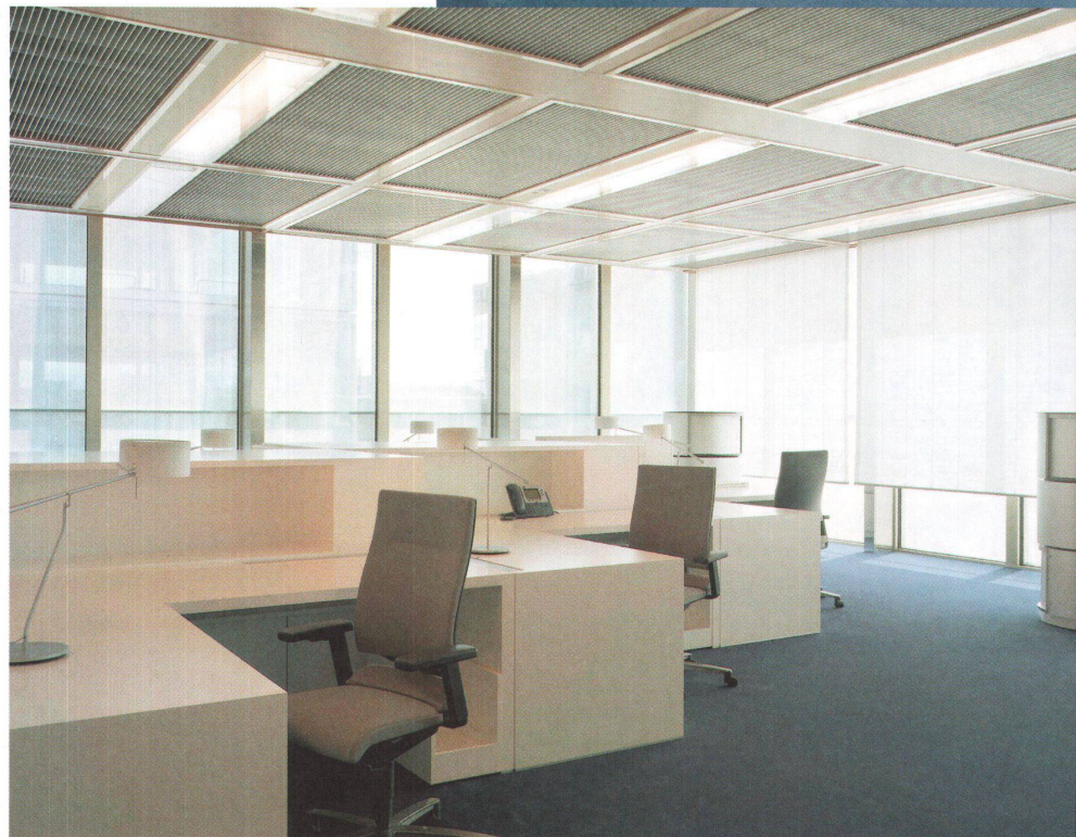
^ Workplace islands: A movable partition is integrated in the synthetic resin desktop.