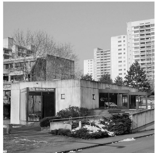
Fig. 1: Kaiseraugst, Liebrüti: "Tile works". The steel structure (dark window frames) of the protective building over the two tile kilns of the fortress garrison (with an exhibition on tile making).

The two tile kilns at Liebrüti 2 , preserved inside a large building (fig. 1), were sampled in 1981 for an archaeomagnetic study (fig. 2). In the case of the larger kiln 3 10 pieces of tile were taken from inside the central heating canal and also 5 fragments of baked clay removed from the floor using the glued-disk technique. Only 6 pieces of tile were sampled from the smaller kiln 4 . All the samples were oriented using a geologist's compass using a 13 cm plastic distance piece to reduce any influence of the kiln on the compass needle (fig. 3). The location of the kilns within a building meant that it was not possible to check the orientation even of the floor samples with a sun compass.