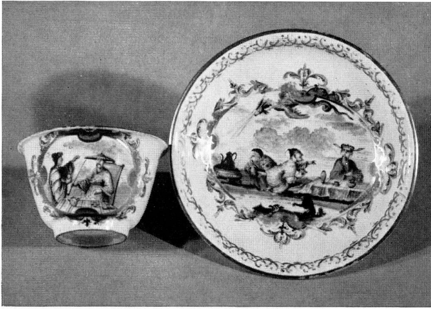
Fig. 17 Tea Basin and Saucer, Meissen, painted by J.G. Herold, about 1723. No mark.