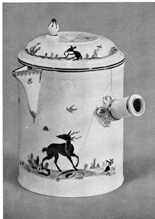
Fig. 15 Extra Large Chocolate Pot, Meissen, Fable Animal decoration, painted by J. G. Herold, about 1720—1721. No mark.