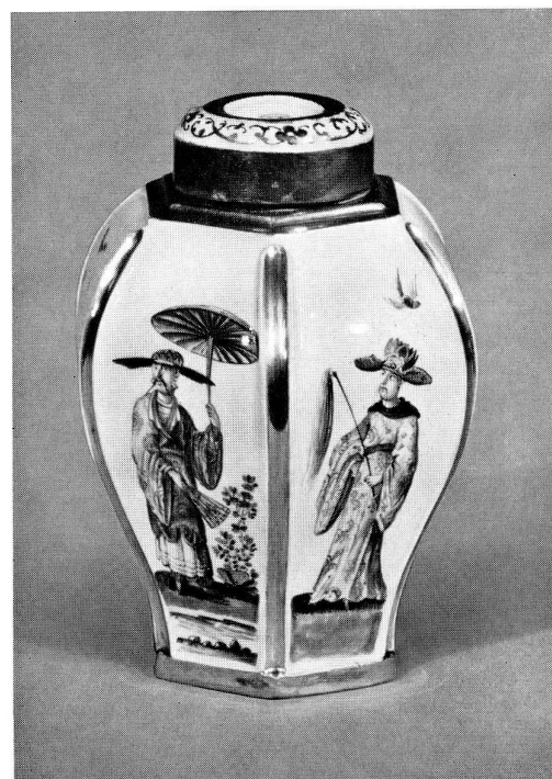
Fig. 16 Hexagonal Tea Caddy, early concave ribs, Meissen, painted by J. G. Herold, about 1723. No mark.