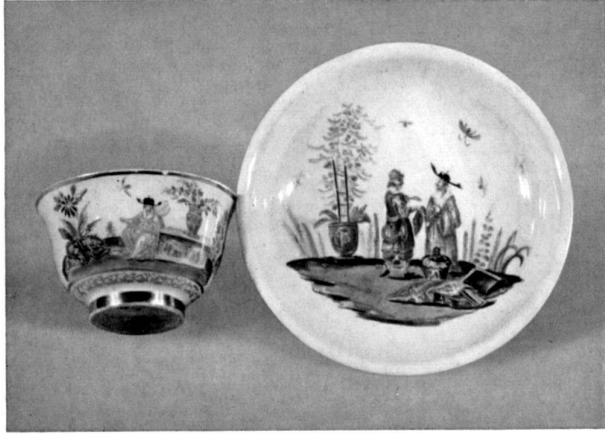
Fig. 5 Tea Bowl and Saucer, Du Paquire painted by J. G. Herold, before April 1720.