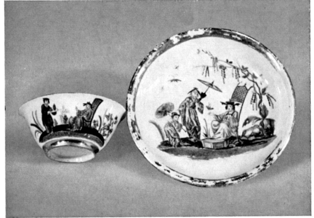
Fig. 6 Tea Bowl and Saucer, Du Paquire painted by J. G. Herold, before April 1720.