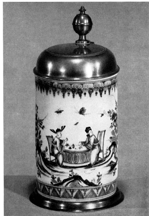
Fig. 20 Tankard, Meissen, rare combination of Chinoiserie and Kobler Blue, painted by J.G. Herold about 1723. No mark.