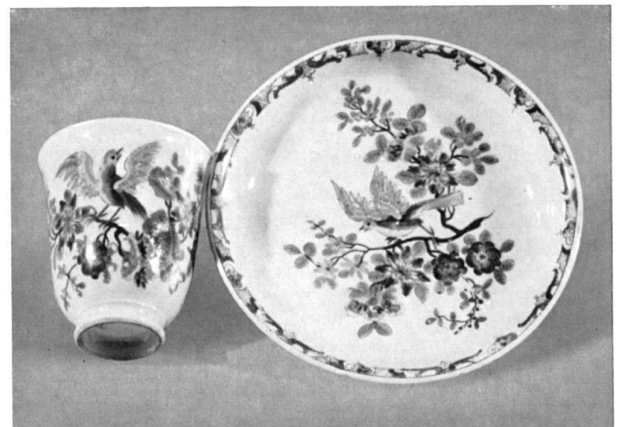
Fig. 8 Beaker Cup and Saucer, Du Paquire painted by J. G. Herold, before April 1720.