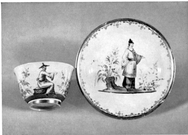
Fig. 7 Tea Bowl and Saucer, Du Paquire painted by J. G. Herold, before April 1720.