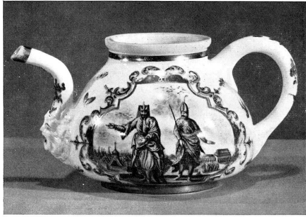
Fig. 18 Tea Pot, Meissen, decoration after Compt Ferriol, painted by J.G. Herold 1723—1724. K. P. M. mark.