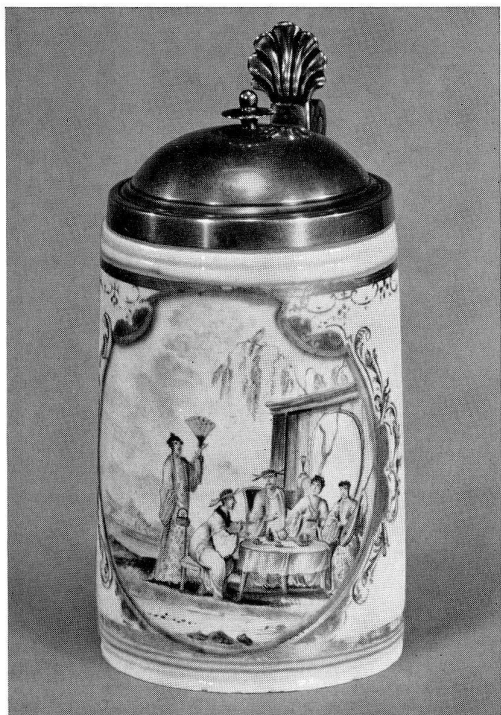
Fig. 13 Small Tankard, Meissen, decoration adaptation from Augsburg etching by Engelbrecht, painted by J. G. Herold about 1721. No mark.