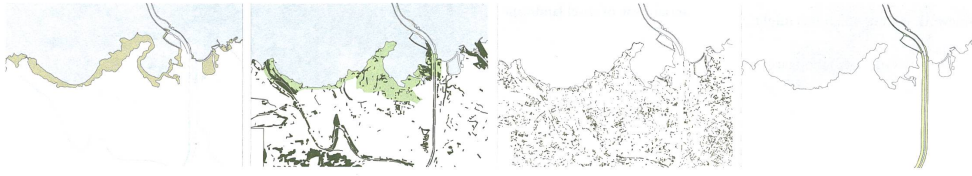
landscape structure diagrams