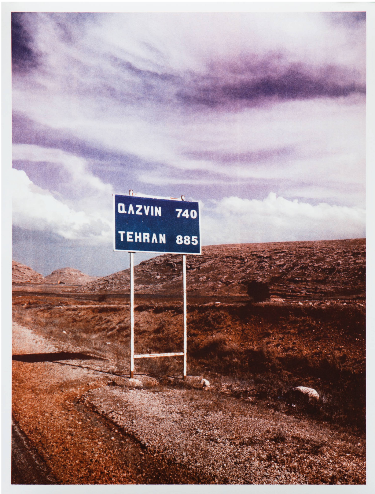
Qazvin/Teheran Two-colored lithograph on Zerkall Bütten Paper 87 x 67 cm