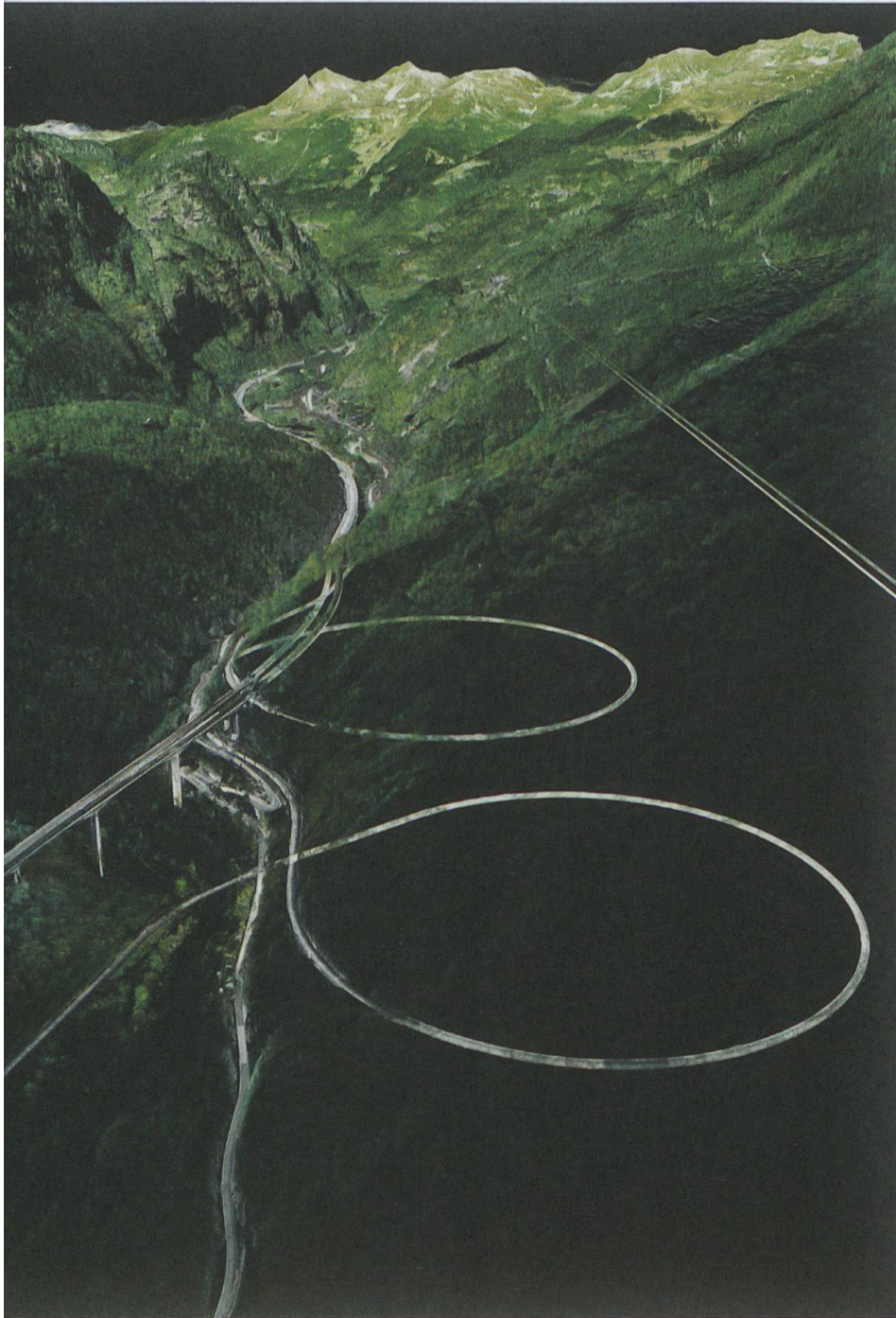
View onto the helical tunnels near Giornico, on the south side of the Gotthard Pass: on the upper right the Gotthard Base Tunnel, on the lower left the highway bridge crossing the cantonal road

most important infrastructures of the Alpine crossing in relation to the topography in an audiovisual way, thus enabling a completely new understanding of the Gotthard region.