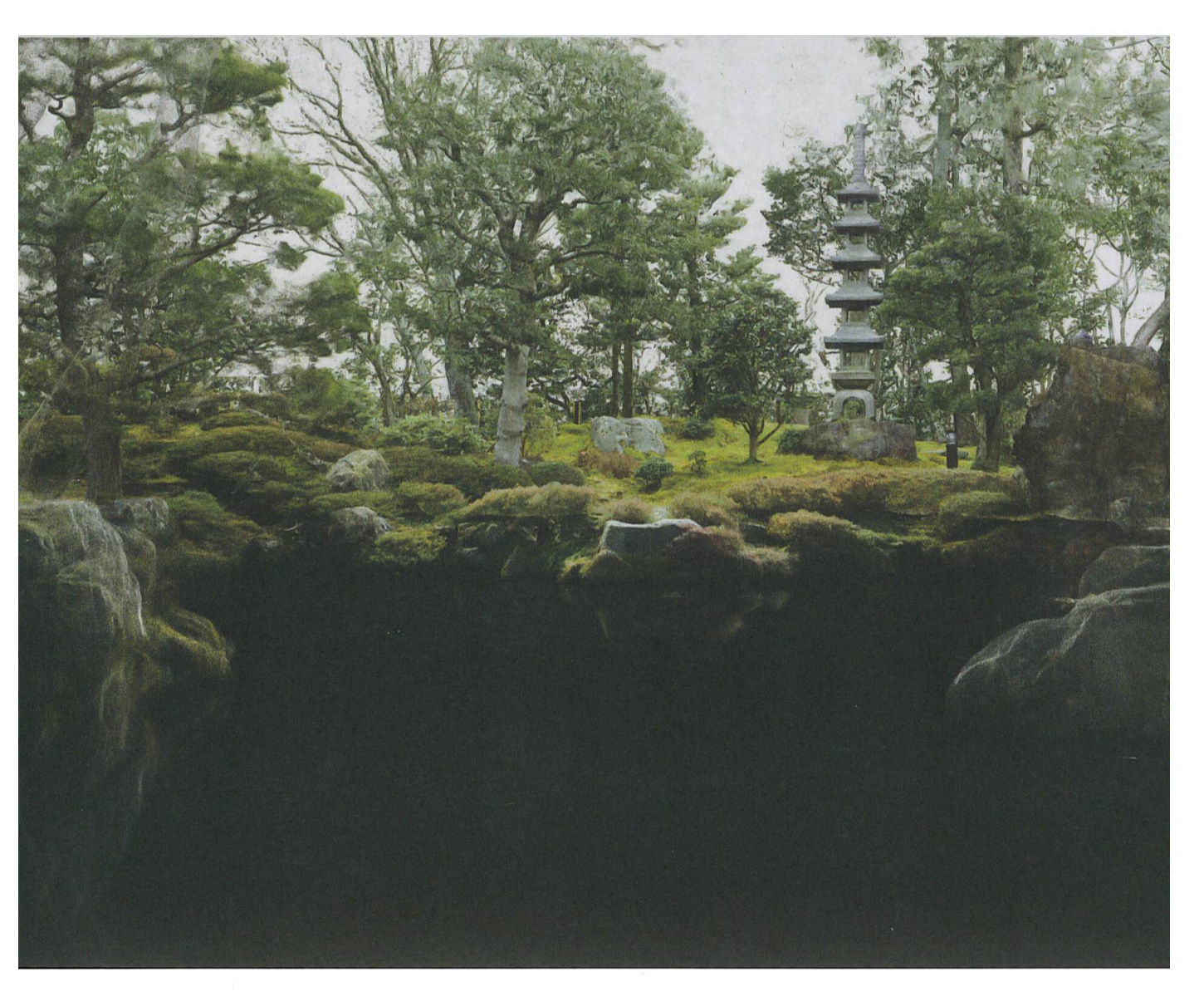
Pond in Dainei-ken, Kyoto