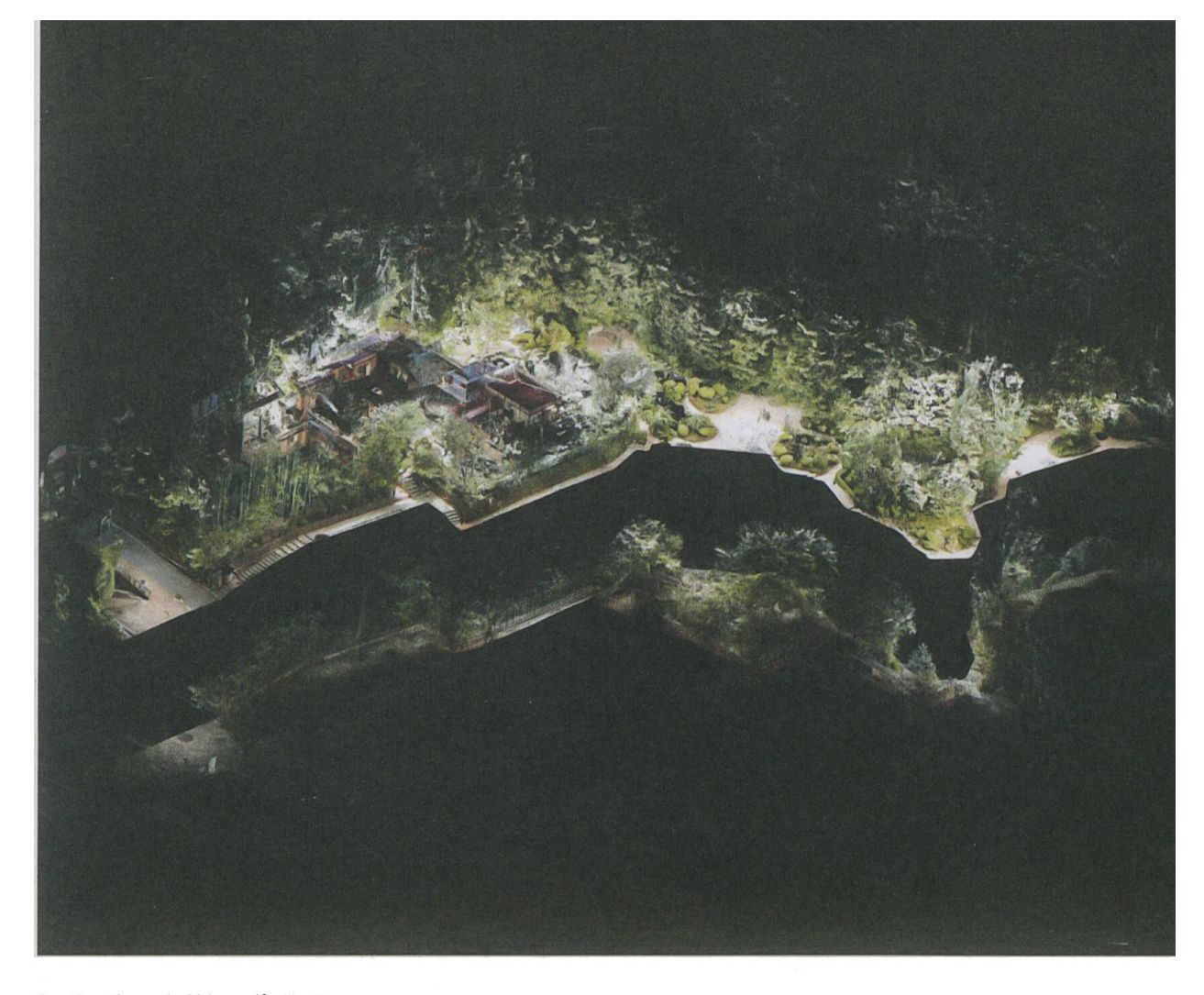
Section through Shisen-dô, Kyoto

cloud animations with sound compositions from Japanese gardens as a method for exploring space. The animations gave the students a form of expression in which language does not play the primary role and which allows them to bypass familiar and distracting patterns of spatial representation. Point cloud representation allows a shift from the culturally shaped perspectives and their historical connotations. Views and paths that are impossible for human perception on site provide a structure in which new, unfamiliar concepts can be implemented. The transparency of the model creates ambiguities