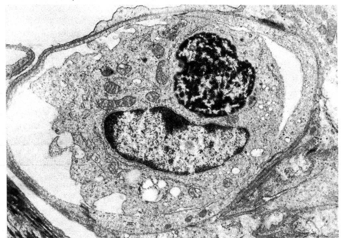
Fig. 1: Pulmonary intravascular macrophage with secondary lysosomes. X 15 000.

Pulmonary intravascular erythrophagocytosis has been reported to occur in species with PIMs (1, 5, 7, 9), as has granulocyte phagocytosis on inoculation of bacteria (2), endotoxins (8) and viruses (7); according to some authors (2, 7-9), these cells play a major role in lung clearance. According to our own experience, most PIMs show