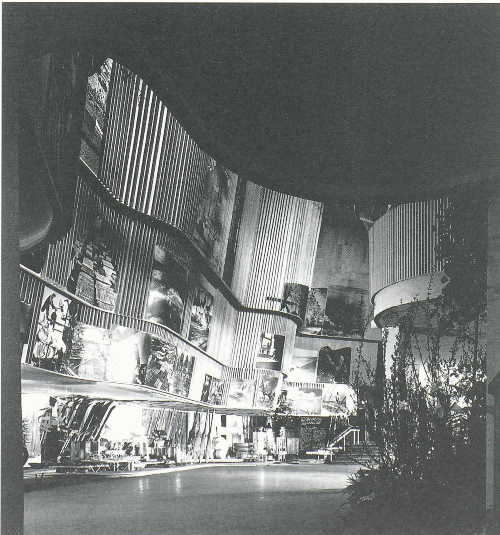
Finnish Pavilion, New York World's Fair, Queens, New York, 1939. Aina and Alvar Aalto. [left] Jyväskylä Workers' Club, Jyväskylä, Finland, 1924-25. Alvar Aalto. [above]