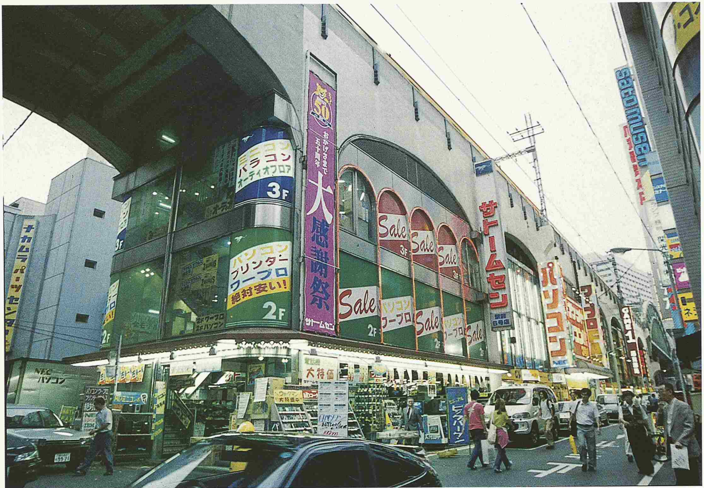
«Electric passage»; function: railway bridge + shopping arcade/ site: sotokanda, chiyoda-ku: In front of the west exit, Akihabara Station, Sobu Line – stacking and extension of the railway line and electric goods district – the railway tracks become a roof to 3 floors of electric goods shopping – 300 m length of shopping arcade – the scale of the frontage of each shop divides this section of railway into smaller and smaller proportions

Anyway, surely too much «on» can't be good for our mental landscape. If we switch all 3 orders «on», there is only one possibility for achieving satisfying architecture, but if we allow any or all aspects to be «off», then suddenly the possibilities for variation explode to 8 (2 to the power of 3). This establishes a huge release for those who are designers. When we say that we can sense the pulse of Tokyo in the «da-me architecture» which includes some aspect of being «off», it means that even though the urban space of this city appears to be chaotic, in exchange, it contains a quality of freedom for production. Furthermore, we hope in our design work to clearly represent possibilities for the urban future by being consistent with the principle findings of our research. The observations can only gain a certain clarity once they have been studied through design and vice versa. Such interactive feedback between observation and design is one efficient method through which to contribute to the city through the scale of architecture.