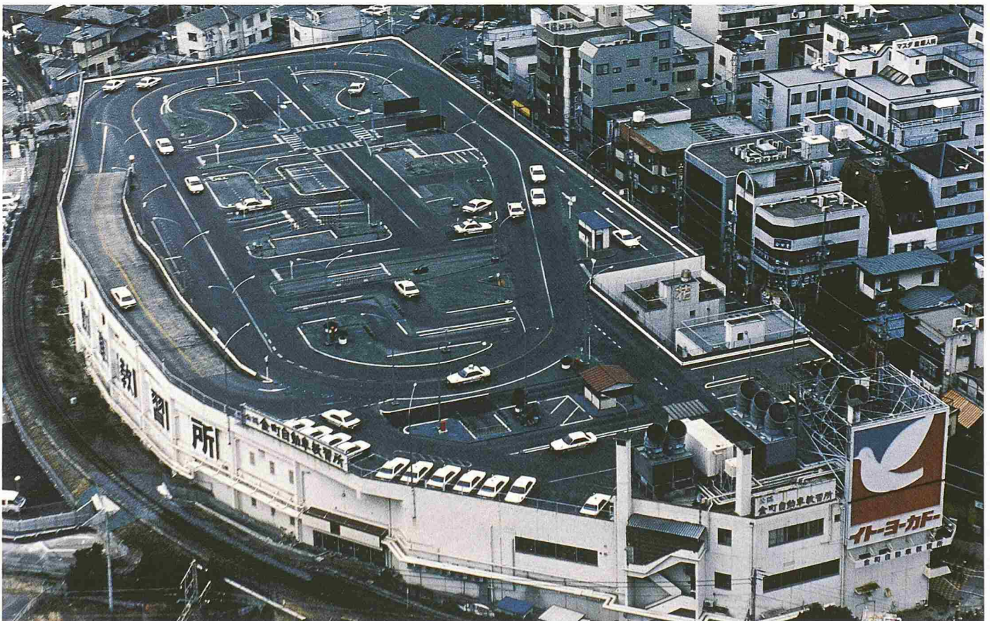
«Super car school»; function: supermarket + driving school/site: kanamachi, katsushika-ku: on top of the double layer supermarket lands a layer of driving school – the site includes the parcels of other people's property which could not be purchased – the condition of the site, framed by the curve of the railroad, is expressed directly in the extruded volume of the building – the entry ramp is framed above by the practice slopes for hand brake starts learner cars, etc.

The buildings of Made in Tokyo are not beautiful. They are not perfect examples of architectural planning. They are not A-grade cultural building types, such as libraries and museums. They are B-grade building types, such as parking, batting centres, or hybrid containers including architectural and civil engineering works. They are not «pieces» designed by famous architects. What is nonetheless respectable about these buildings is that they don't have a speck of fat. What is important right now is constructed in a practical manner by the possible elements of that place. They don't respond to cultural context and history. Their highly economically efficient answers are guided by minimum effort. In Tokyo, such direct answers are expected. They