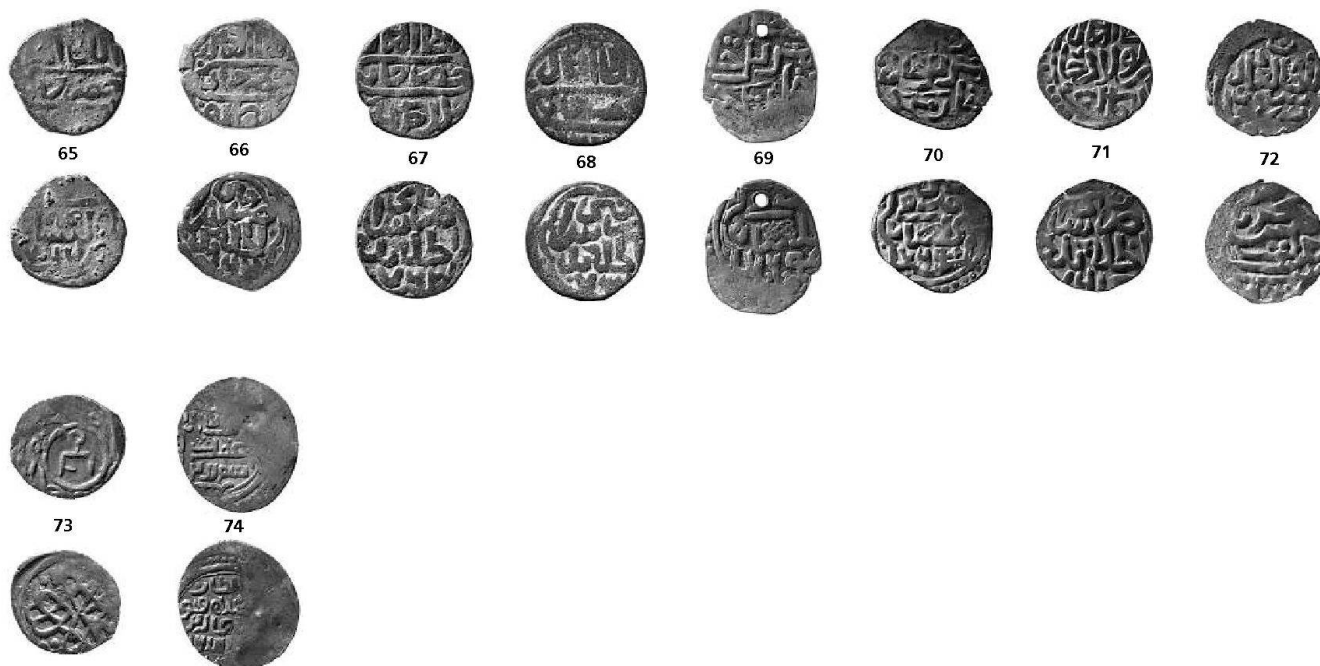
Cat. 65–74: Coins of Khizr Khan (cat. 65–68), Murid Khan (cat. 69–70), Khir Pulad (Pulad Khojah) Khan (cat. 71), 'Aziz Shaykh Khan (cat. 72), Anonymous (cat. 73) and coin of the Eretnids (cat. 74).