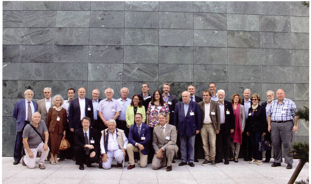
Fig. 1: Speakers and participants of the 1 st conference on Swiss and Italian monetary relations.