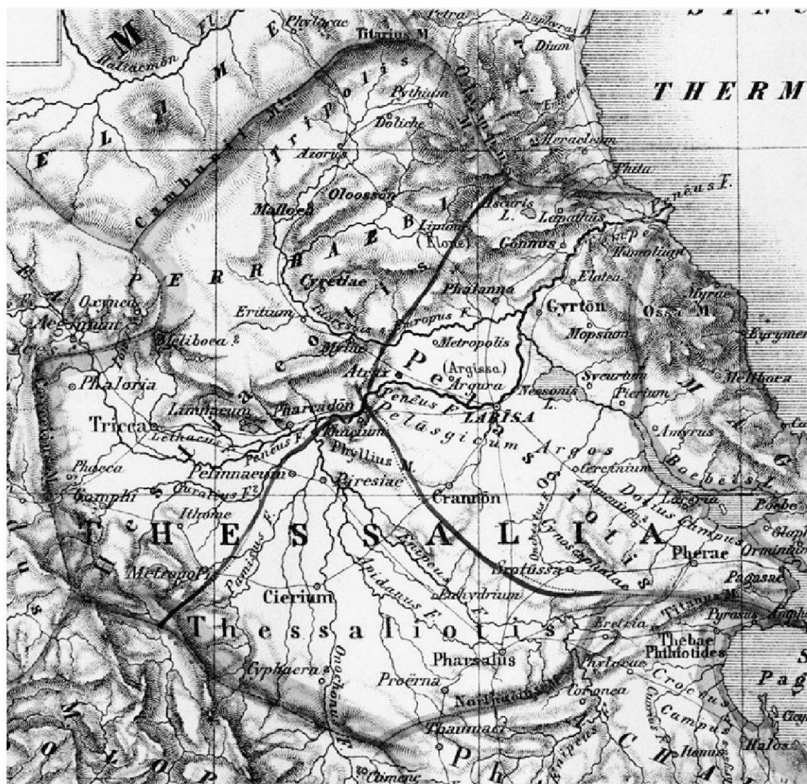
Map of Thessaly (see n. 5)

The obols are a little less elusive. Schwabacher published a single specimen from the collection of G. Empedokles in 1939 ( Pl. 3, 14 ). 9 Earlier, Sir Herman