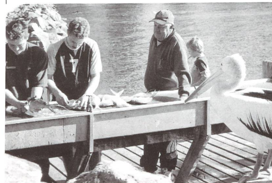
Die Pelikane haben offenbar Hunger