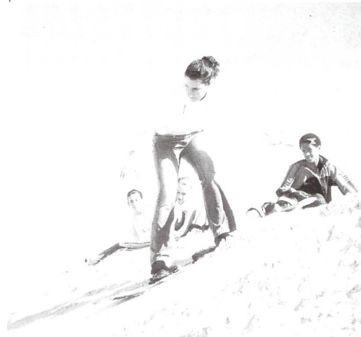
Sandboarding....eine rutschige Angelegenheit!

Basically, you get the same food as here, but it tastes differently because of the production conditions and they've got a small choice of fruits (mainly apple, bananas and pears). You often get big meals in the restaurant, just take the rest home as a take-away! Sometimes you have to order at a buffet in a restaurant and the food will be brought or you'll be called.