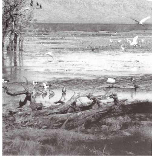
Nebst den Vögeln leben hier auch Krokodile...