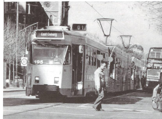
Wusste nicht, dass es Trams in Australien gibt...