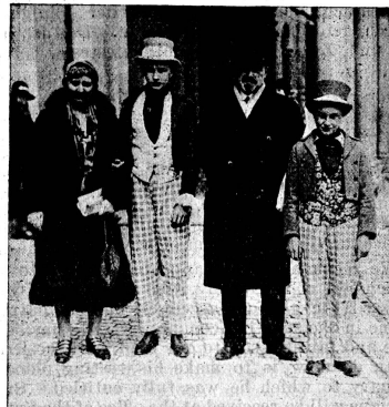
The Two Young Authors in a Family Group at the Zurich Sechseläuten.