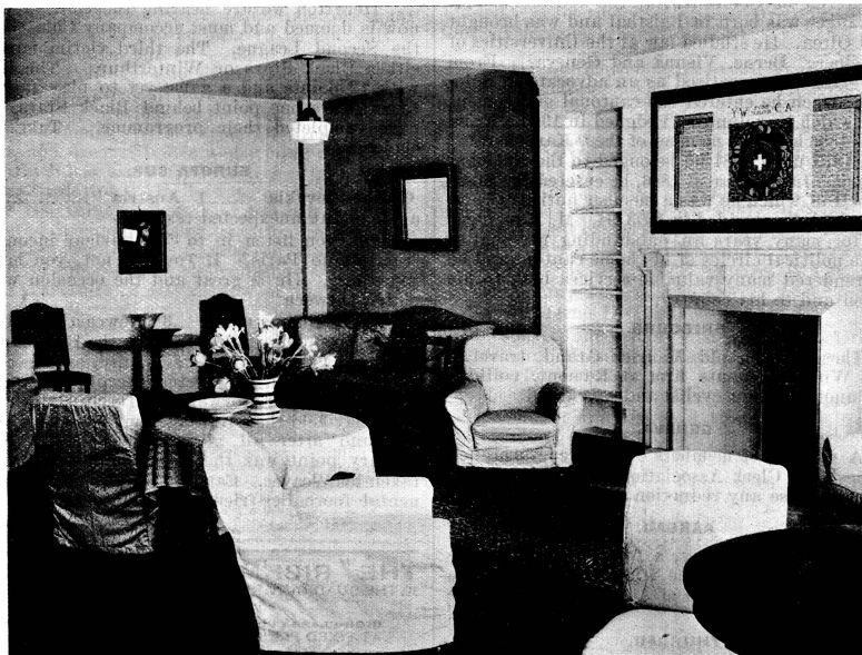
A corner view of the Popular "Swiss Parlour," at the Central Club.

The hostel, which is the first of its kind to be built in England, is open to all girls irrespective of class, creed or nationality, it is not a restrictive club. Young women will be able to entertain their men friends. "Mixed" tea parties can be given in the lounge. Membership of the Club costs only 12/6 a year.