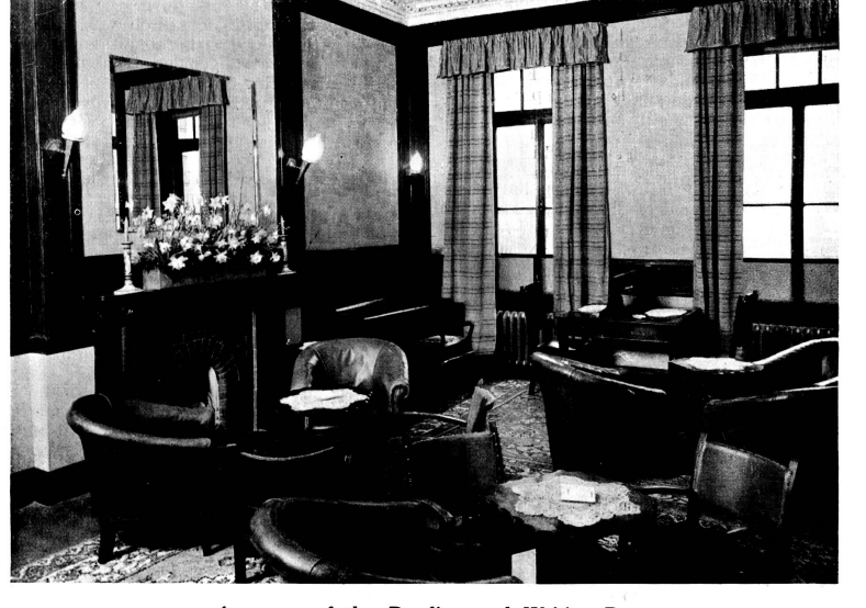
A corner of the Reading and Writing Room.

Casting a glance back over the Lounge on parting from my aimable guide I noticed a general look of contentment on the faces of the general look of contentment on the faces of the guests who were taking their coffee, and this is uncoubtedly a proof that they are happy and com-fortable at the "Foyer Suisse," I would be happy too, where I to stay there if still a bachelor.