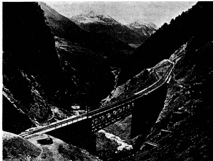
THE LOETSCHBERG RAILWAY.

We need hardly mention from which country the trouble comes, and we sincerely hope that our authorities will be firm, there must be no propaganda, from whichever country it comes, allowed within the territory of the Confederation; organisations which have a political background should be dissolved and individuals who are trying to propagate a certain "Kultur" which is in contradiction and distasteful to our national ideals, should be forthwith expelled. There must be no policy of "laissez faire" allowed.