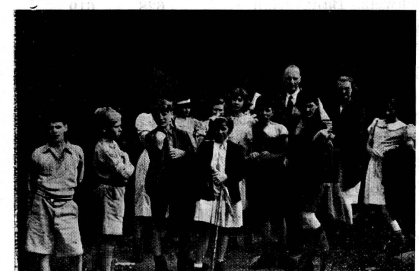
GROUP TAKEN AT KANDERSTEG.

At Berne station, where the train stopped for 10 minutes we met our first Swiss friends, mostly relatives of our children. One friend surprised us with a huge pot of jam.