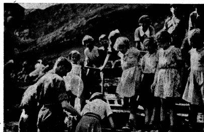
ON A MOUNTAINEERING EXCURSION.

At Spiez, Thoune and Berne, relatives came to the station. Then the children made their beds as soft as they could in the speeding train, and as we crossed the Swiss frontier they were nearly all asleep. Some of the senior boys, however, told me that they could not sleep, and on the suggestion of the conductor, we moved to a first-class