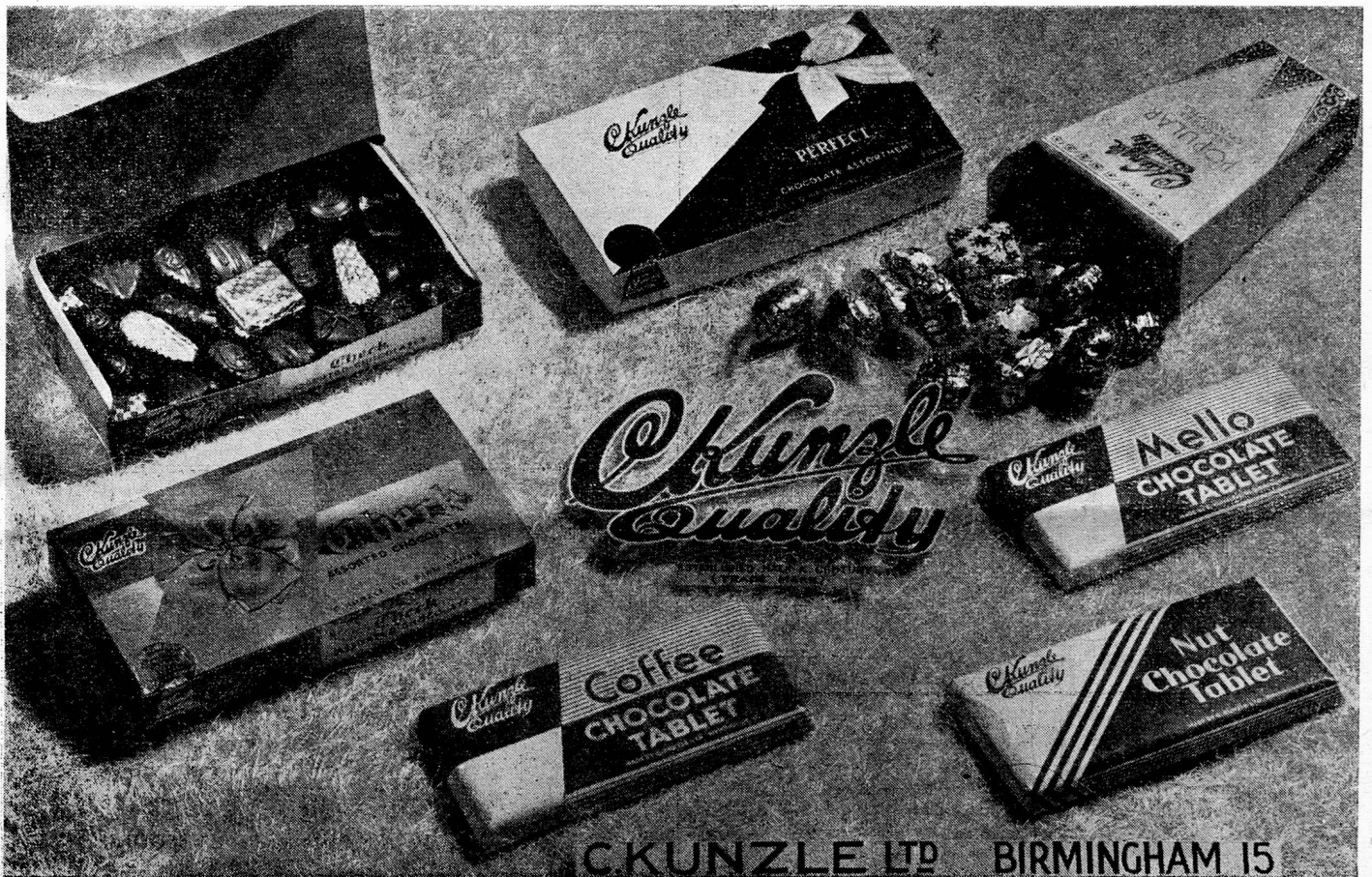
C KUNZLE LTD BIRMINGHAM 15