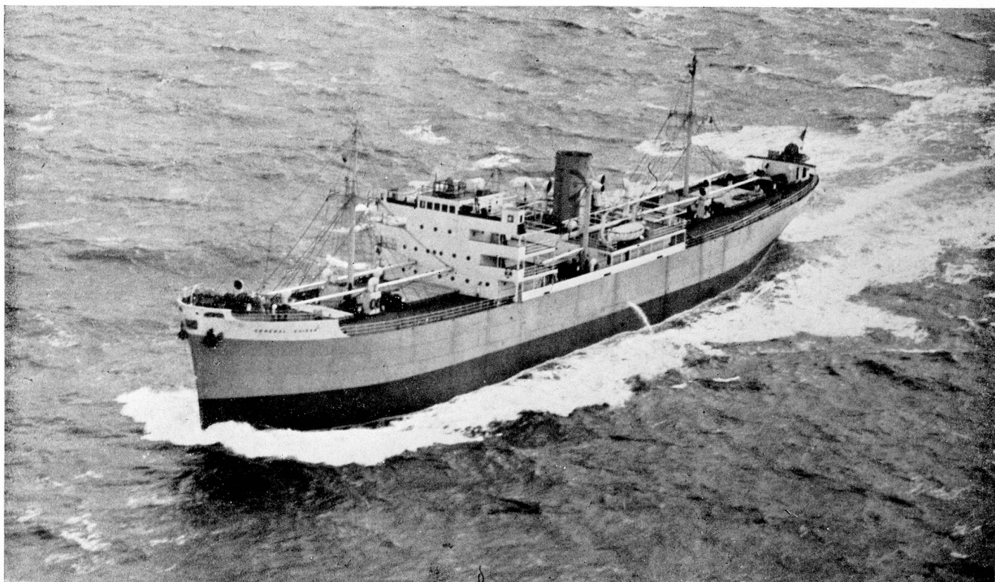
M.V. "GENERAL GUISAN" SEEN FROM THE AIR.