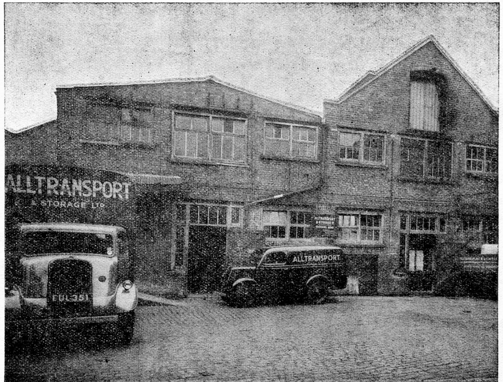
Our cartage and packing depot at Eagle Wharf Road, New North Road, N.1.