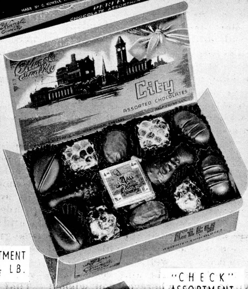
"CITY" ASSORTMENT 2/2 PER 1/2 LB.