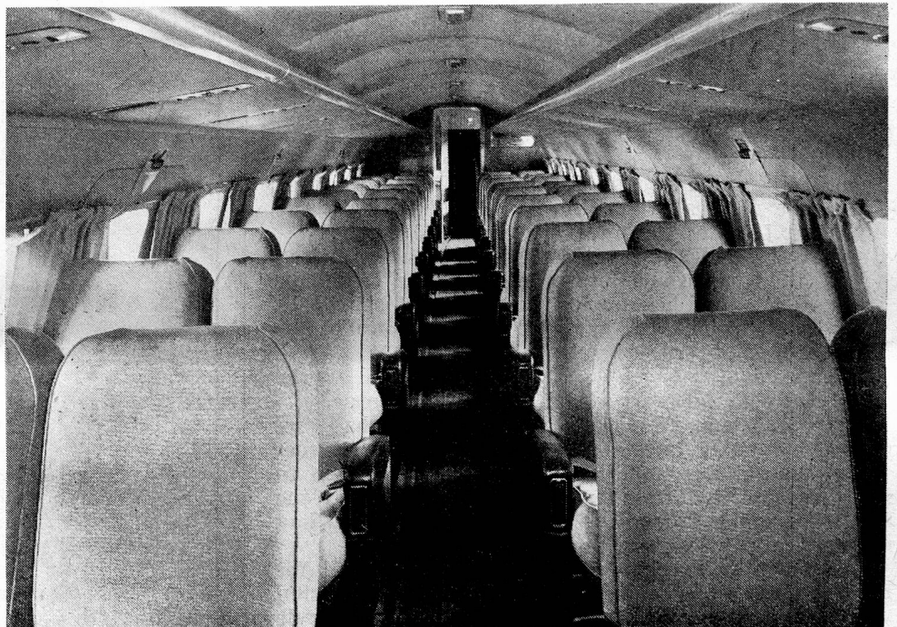
INTERIOR OF "CONVAIR"

The flight from Northolt to Geneva thus having taken exactly 1 hour and fifty minutes, or 20 minutes