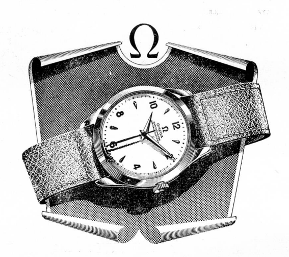
PRECISION MAKES PERFECT

ONLY watches of exceptional precision may be called "Chronometers". The standard of precision which they must attain is set by astronomical observatories and by Official Rating Bureaux under the control of the Swiss Government. Every watch under their supervision must pass the most severe tests over a fifteen day period before it is qualified to receive a Rating Certificate and the title "Chronometer".