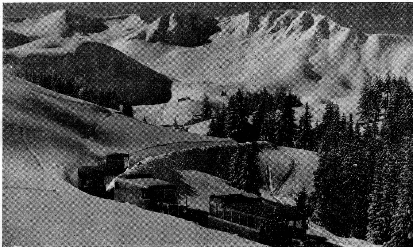
Convoy of Alpine Coaches near Hahnenmoos.

However, prevention is better than cure, and here, as elsewhere, nothing is left undone to shield the track by means of snow and avalanche barriers, galleries, and thousands of trees planted for this purpose. The galleries mean, of course, absolute safety, but are expensive to build. Barriers, of which there are many types, are generally situated high up the slopes, above the tree line. Where and how to place them is of great importance and needs an intimate knowledge of the country, great familiarity with weather conditions, especially the force and direction of the wind. It