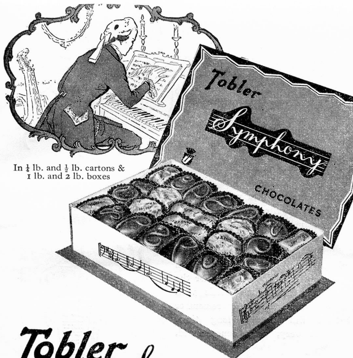
In ¼ lb. and ½ lb. cartons & 1 lb. and 2 lb. boxes

Swiss National Tourist Office, 458, Strand, London, W. C. 2.