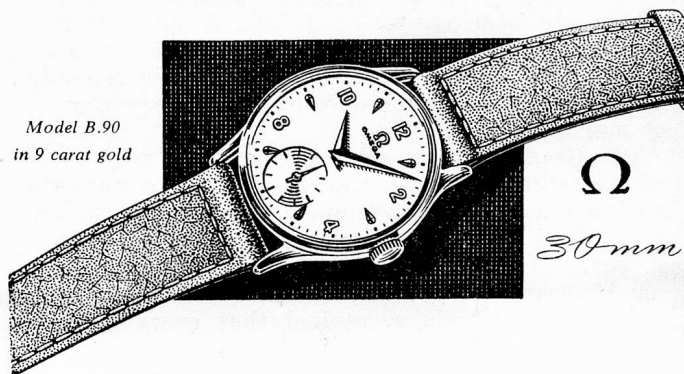
Model B.90 in 9 carat gold

OLYMPIC GAMES — For 20 years Omega has timed the Olympic Games. Again the most exacting and impartial experts have chosen Omega to time the 1956 Olympics in Melbourne, Australia. This is the highest recognition any watch has ever received from the countries of the world.