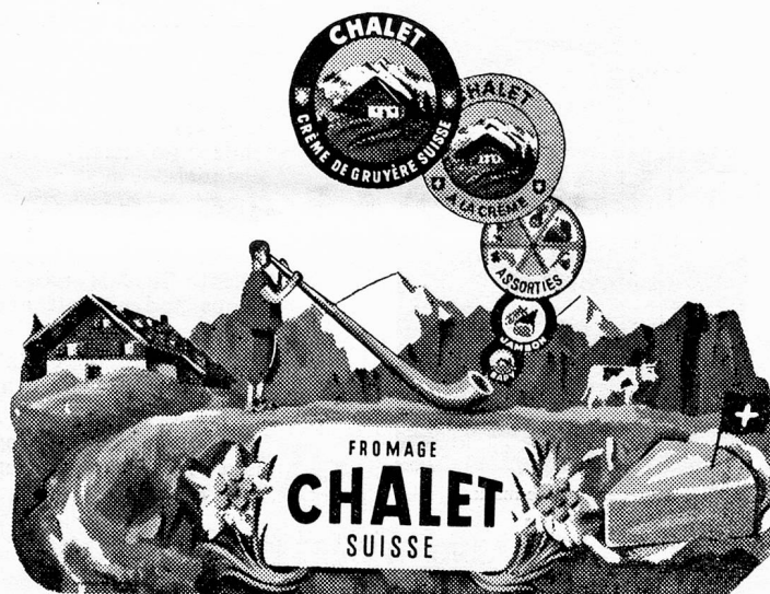
Famous all the World over for Quality and Tradition

The Federation subsidizes its Institute today to the extent of some 10 million francs a year; over and beyond this it periodically grants credits for any buildings, extensions or equipment that may become necessary. On the last occasion in 1946 credits of 27 million francs were approved by the Federal