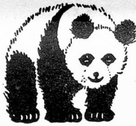
Regd. Trade Mark

Everyone adores them they're so so gay and colourful in a variety of designs:— stripes, spots, checks and tartans. Also self colours in satins, taffetas, failles and petershams. Ask for "Panda" and know you are buying the best.