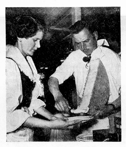
Räclette — a Valais speciality and a top draw with visitors.

The approach of better weather has even persuaded the Valaisans to enjoy the luxury of an openair theatre performance at Sierre, where the talk has been of the cowfights and râclette and all the other attractions that will be tempting visitors Valais-wards this summer.