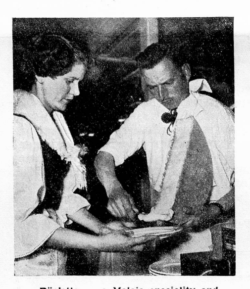
Räclette — a Valais speciality and a top draw with visitors.

The approach of better weather has even persuaded the Valaisans to enjoy the luxury of an openair theatre performance at Sierre, where the talk has been of the cowfights and râclette and all the other attractions that will be tempting visitors Valais-wards this summer.