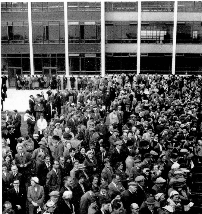
AWAITING THE OPENING.