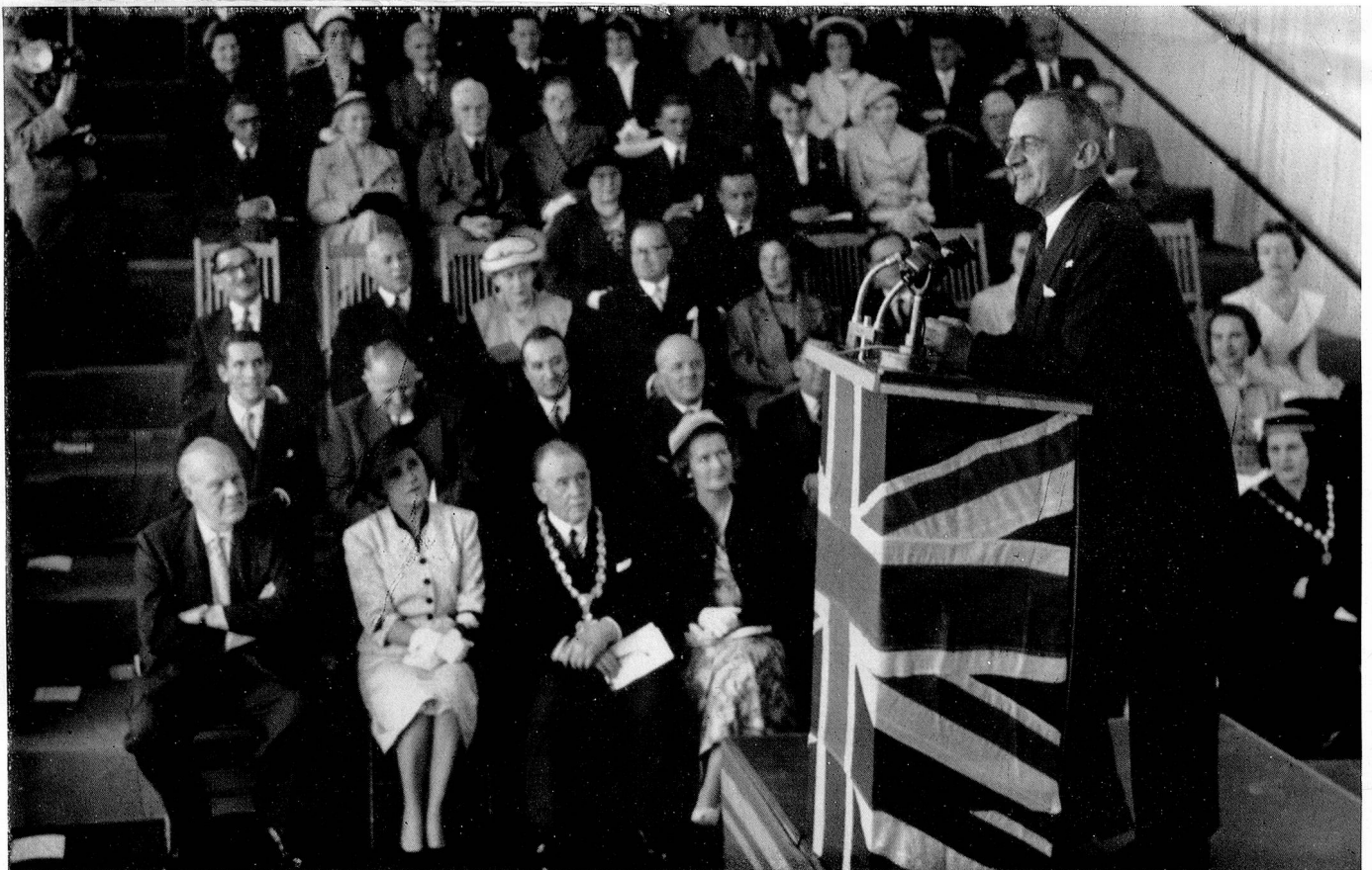
THE SWISS MINISTER GIVING HIS ADDRESS.

This Spring we celebrated in Geneva and in London the first centenary of the coming into force of the Treaty of Friendship, Establishment and Commerce between Switzerland and Great Britain. This treaty is the basis of our relationship; it is a very liberal treaty, embodying in its text the lofty ideals which inspire our peoples; it has been and still is the foundation for a happy mutual expansion of our trade. Such beneficial relations existed, of course, many